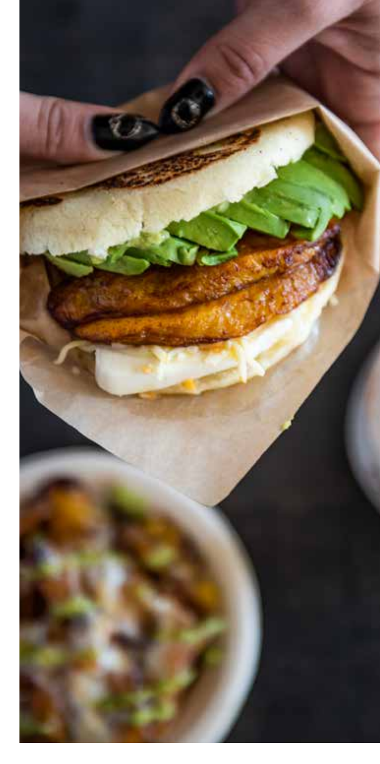
(gf) - gluten free (df) - dairy free (v) - vegetarian

full-sized arepas packed in a tray, 10 to an order, 100% gluten-free la original (v) $110 queso (v) $120 jamon y queso $110 pollo guisado $150 reina pepiada $150 pabellon $140 el caribe $150 domino $110 add avocado +$30 add plantains +$30